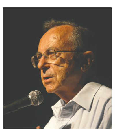
Prof. Moshe Arens

Their support represents perhaps one and a half percent of the Israel gross national product and if this is decreased or eliminated it will not harm us, and certainly not harm us critically. We do not need to change direction because of some dependence or other on a friend like the United States.