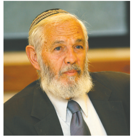
Prof. Eliav Shochetman