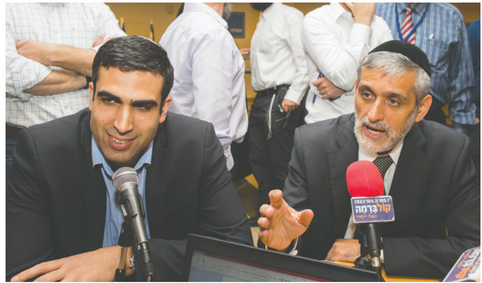
MK Yoni Chetbon with MK Rabbi Eli Yishai.

The very fact that we are here and not in Uganda stems from the right that is anchored in the Book of Books. We are progressing in phases and we have no authority or right to withdraw when we are at the height of the process.