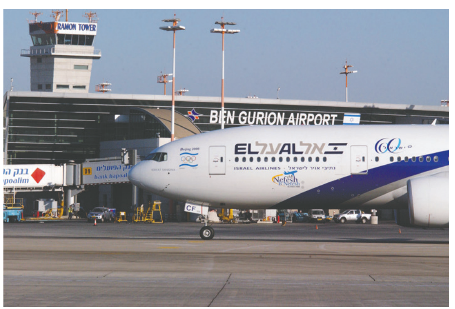
Ben Gurion Airport would be paralyzed, there would be no tourism, no commerce

there is no military. There are those who think that we will be able to remove the residents but maintain a military presence. There is no such animal. This is not the essential reason for our presence in Judea and Samaria but we must recognize this fact".