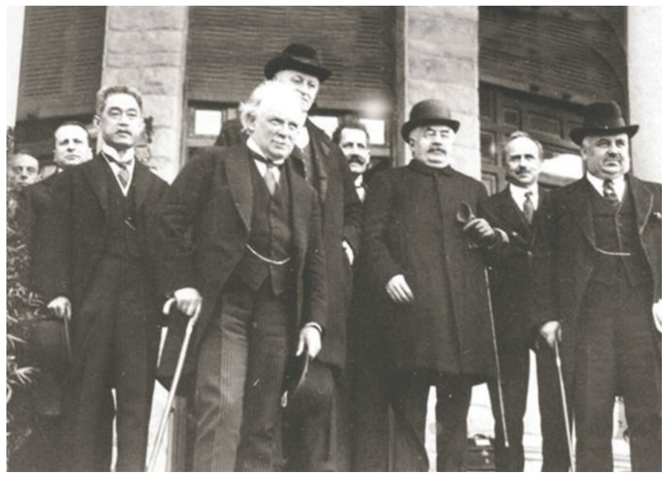
The San Remo Conference April 25th, 1920. With thanks to CILR Canadians for Israel's Legal Rights.

There is no document in international law that grants rights of sovereignty to the Land of Israel to anybody other than to the lewish People.