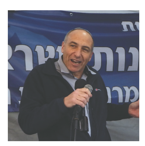
MK Col. (Res.) Moti Yogev at the Mothers' Vigil for Sovereignty 2014.

"Any international promise is worthless. It was so in Lebanon also, as well as in Sinai and in the Golan Heights and the best example is from last year in the Golan Heights where UN forces were overcome and they retreated. No Norwegian mother would send her son to endanger himself on the border between Israel and its neighbors. Such forces are actually no longer relevant in the Middle East. Even American forces would not be loyal to our defense. Until now, they could be depended upon only to