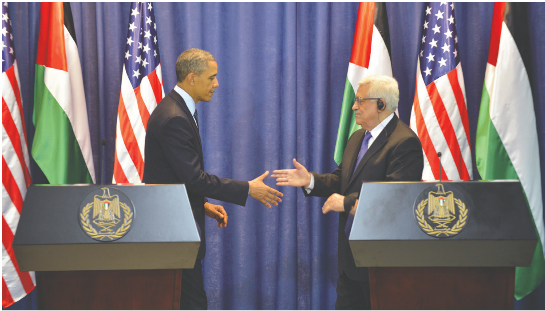
One need not be a prophet in order to know what a monster would be born from the Palestinian "embryonic state" in Judea and Samaria.

This embryonic state carries out - in schools, in mosques and in the media - brainwashing on an entire generation. It puts into the heads of its youth the idea that "there is no solution to the Palestinian problem other than by means of "jihad"