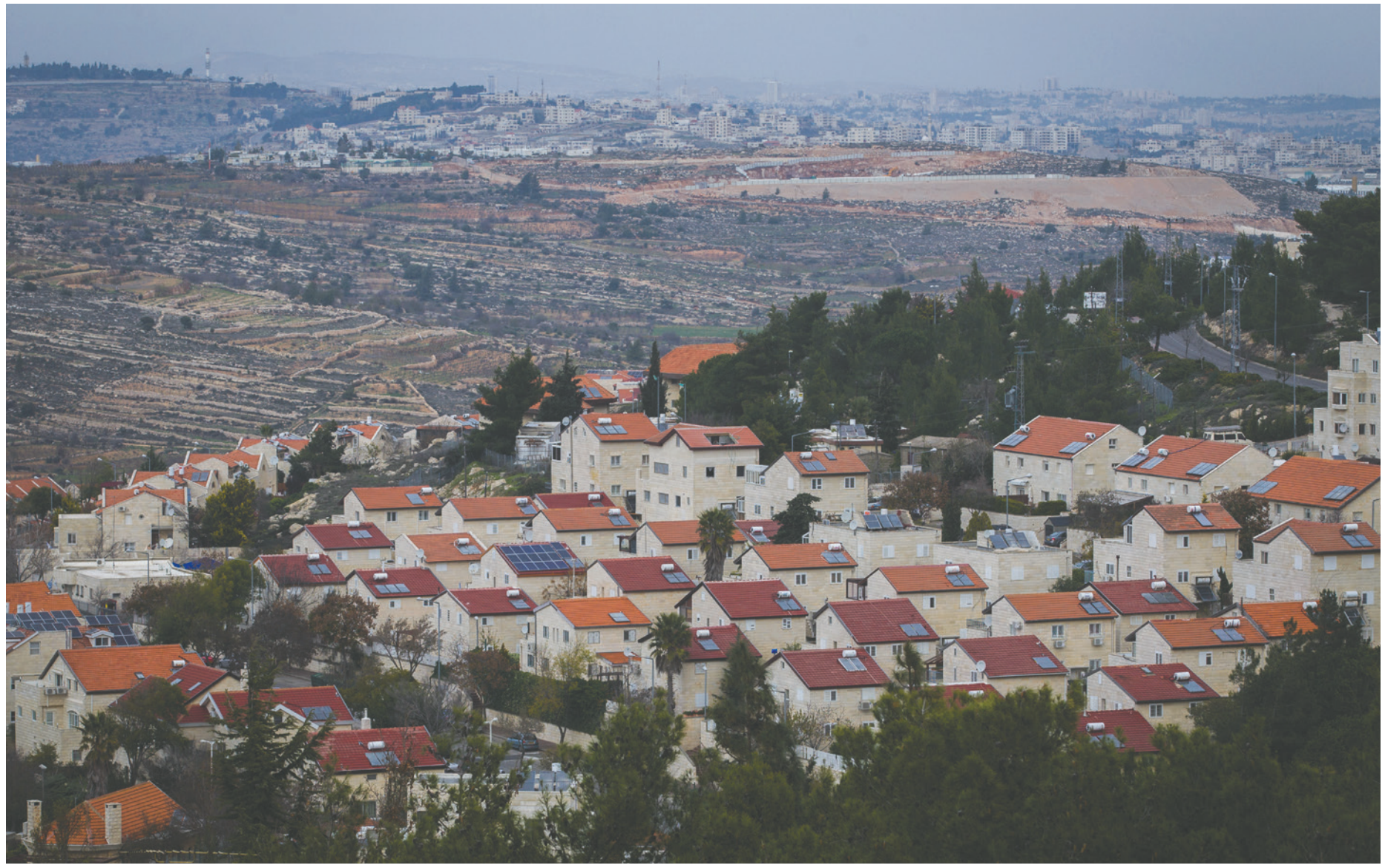
The Palestinians do not want only Judea and Samaria. They see the goal as a Palestine from Metulla to Eilat. The community of Efrat between Jerusalem and Hebron

themselves in Arabic. We wanted to hear from him what is said in the PA internally, not in sanitized language, or in the polished and smiling English of Washington lounges, but rather, that which is relayed to the Palestinian masses, to the reader of the Palestinian newspapers, to the Palestinian child and in the rooms of the Muqata where decisions are taken.