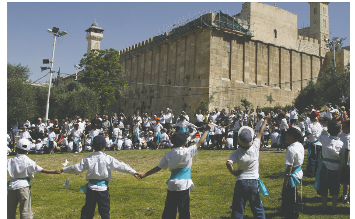
Children celebrate near the Machpela Cave in Hebron, City of our Forefathers

Hizb'Allah, and she is the one who went to Abu Mazen and sold him everything, getting nothing in return and he told her that it is not enough and he wants more. She also was one of the supporters of the expulsion from Gush Katif, so you ask me if she doesn't understand? No. She does not understand. There are people to whom, unfortunately, the regional reality is not clear to them. They prefer to dig in their heels and stick to the old slogans that have lost their value. They promised us democracy and openness in the Arab Spring and we see what we got. Any child could analyze the reality around us but there are those who prefer to ignore it. It is not only you and I who must ask this question, but anyone who will be voting in the near future".